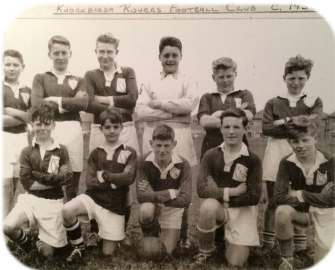
1953 - The star-studded Knockbreda Rovers FC.