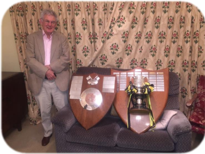
2015 - After successfully 'stealing' the Crown Jewels of Ulster schoolboy rugby...