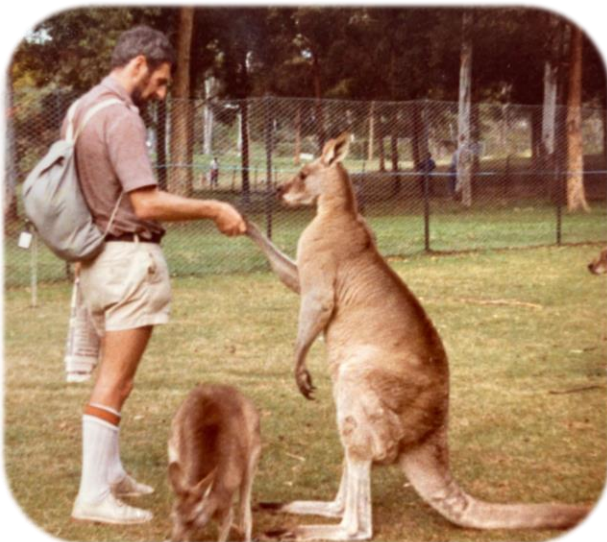
1981 - Baldy introducing himself to the locals, Down Under.